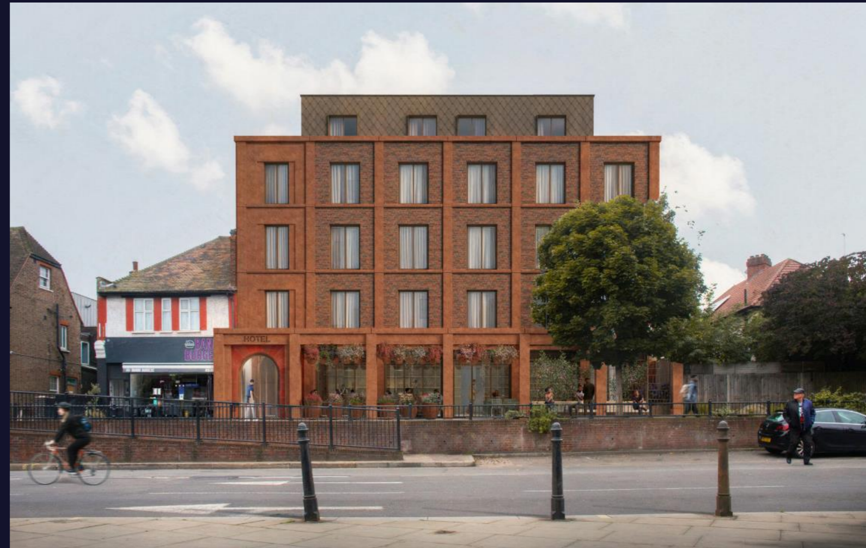
Proposed façade and the front of the building

The scheme represents an improvement of the street scene and local character with more positive and active frontage and public realm improvements.